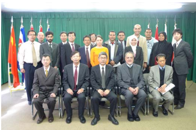
Group photo at the opening ceremony

The 2010 (JFY2009) Global Seismological Observation Course started to learn discrimination techniques between earthquakes and nuclear explosion. We have been conducting this training since 1995. As of today, 139 participants from 69 countries have taken this course. This 2010 training course will be conducted for 2 months from January 7 to March 5, 2010, with 11 participants from 8 countries (China, Costa Rica, Egypt, Indonesia, Malaysia, Pakistan, Paraguay, Tonga) in cooperation with JICA and Japan Meteorological Agency.