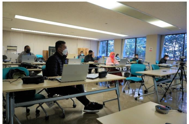
Participants attended the Seminar from BRI

About 45 participants viewed the recorded lectures on demand.