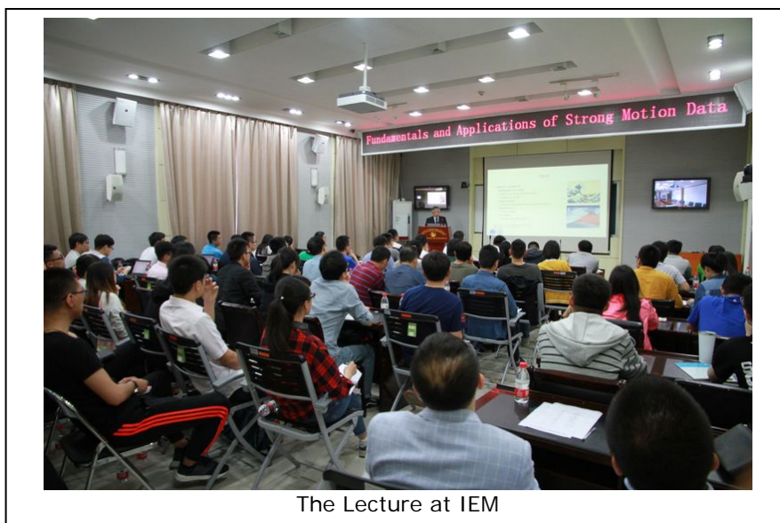
The Lecture at IEM

The Institute of Earthquake Engineering (IEM), China Earthquake Administration, is a research and educational institution on earthquake engineering representative in China. This time, an ex-participant from IEM invited me to give lectures on strong motion observation and related topics to researchers and students of IEM. I thought it was a good opportunity to introduce trends of research on earthquake engineering in Japan to the people who work in a field of the topic in China, so I visited IEM and gave lectures for two days. In addition, I could meet six ex-participants at IEM and deepened our old friendship.