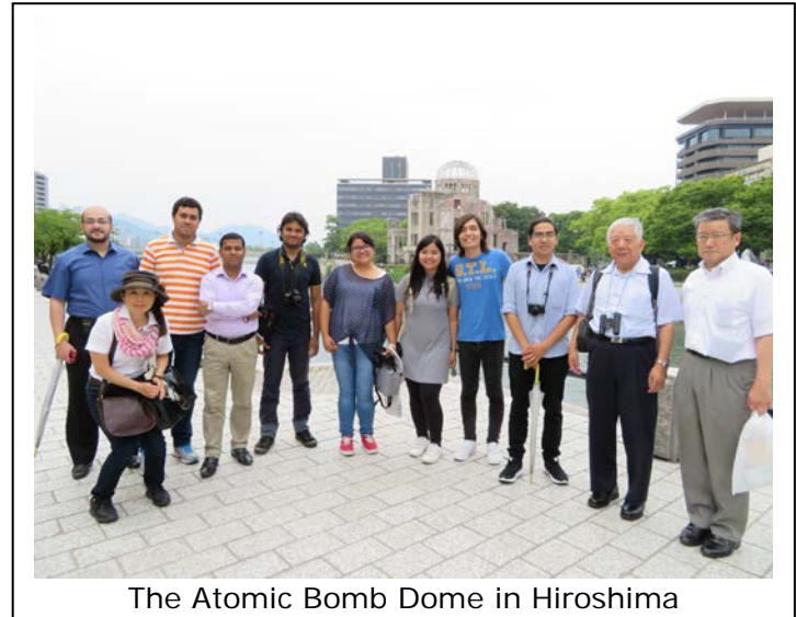
The Atomic Bomb Dome in Hiroshima

Finally, I would like to appreciate the effort for arranging this trip to give us such invaluable learning.