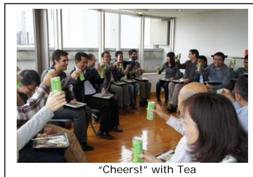
"Cheers!" with Tea

A "Maple viewing" is one of the Japanese autumn events. People enjoy autumn season to see leaves are changing their color from green to yellow or red. It was the first event between IISEE staff members and 2013-1014 trainees who came to Japan at the beginning of October.