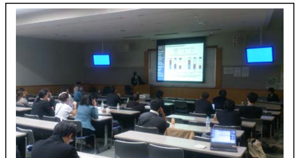
The Second JAEE International Symposium

Seventeen (17) IISEE participants of Seismology and Earthquake Engineering courses took part in the International Symposium held by the Japan Association for Earthquake Engineering (JAEE) at National Olympics Memorial Youth Center, Tokyo, on November 11 and 12, 2013. 28 presentations were made for 2 days, and the IISEE participants joined active discussion.