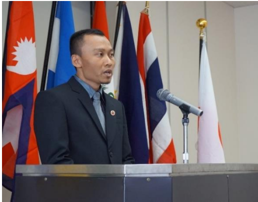
At Closing Ceremony