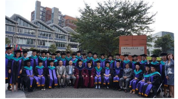
Graduation Ceremony at GRIPS

IISEE training program is conducted in partnership with Japan International Cooperation Agency(JICA). Applicants are requested to apply for the courses through JICA's training and dialogue programs as part of the Japan's Official Development Assistance. The cost of your living and training is borne by JICA and IISEE/BRI.